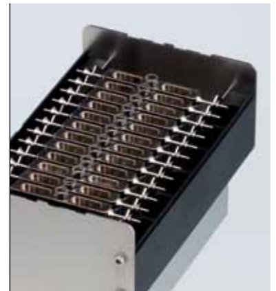
The liquid-containers are transported automatically and placed on the weighing pan individually.

Ergonomic Weighing Tables – designed to enhance your laboratory