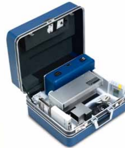
The MCP1-S system, delivered in a transport case, is ideal for on-site calibration.

Automated single- and multi-channel pipette calibration – convenient cost effectiveness Check your multi-channel pipettes with a dispensed volume down to 10 µl at a time in a single step with the MCP System – generating reliable results and giving full traceability.