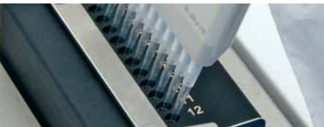
High Throughput Calibration Solutions