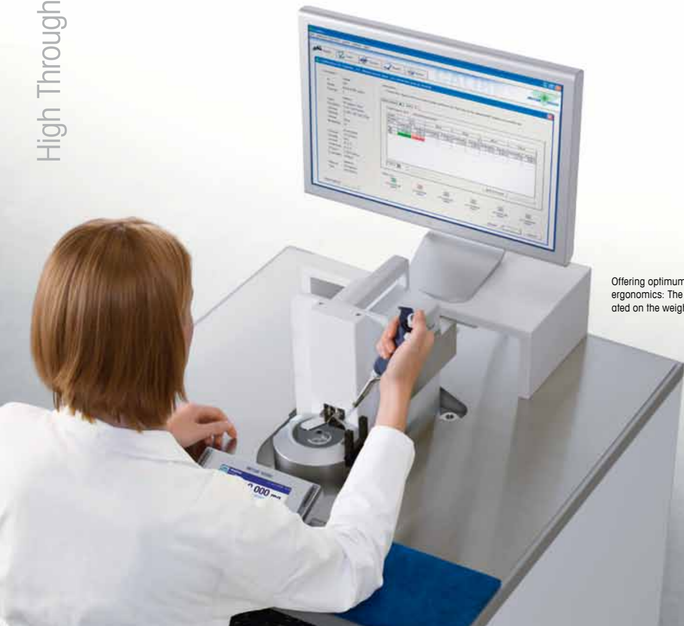
Offering optimum speed and ergonomics: The XP26PC operated on the weighing table.

Fulfill all requirements while speeding up your calibration process: METTLER TOLEDO offers you efficient, compact and ergonomic solutions for single- and multi-channel pipette calibration. These solutions increase productivity and cost effectiveness of your calibration service and bring impressive return on investment.