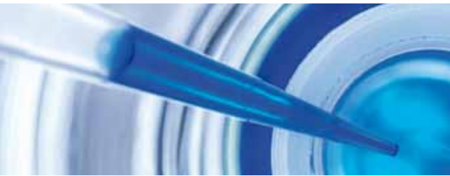
Pipette Performance Testing

The accuracy of a pipette plays a critical part in your application. METTLER TOLEDO offers you gravimetric solutions for occasional performance testing up to professional pipette calibration. We support you in finding the right mix: from self made pipette testing with professional service support to professional pipette calibration stations.